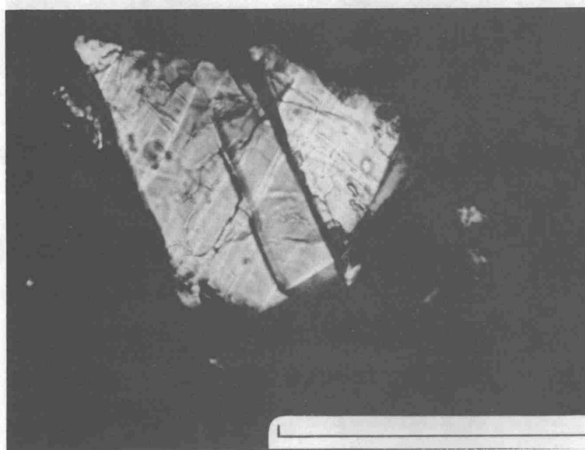
Figure 15B. Same view as Figure 15A; crossed polarizers. Deformation twin lamellae appear as bright lines. Extinction is mildly undulose but not mosaic.